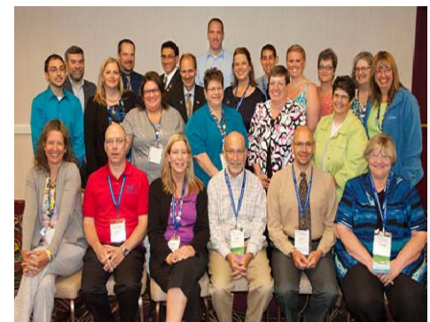
GrassRoots Advocacy Group