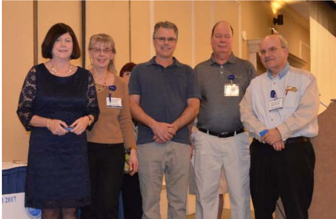
2017 Quarter Century Club Inductees