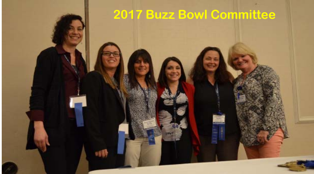
2017 Buzz Bowl Committee