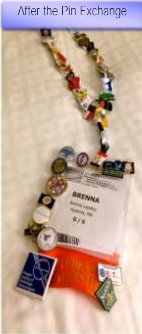
After the Pin Exchange