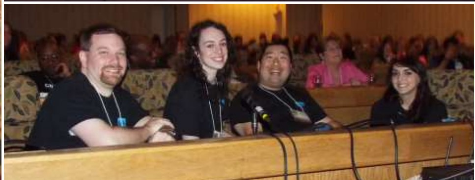
XRI Bike Raffle Winner