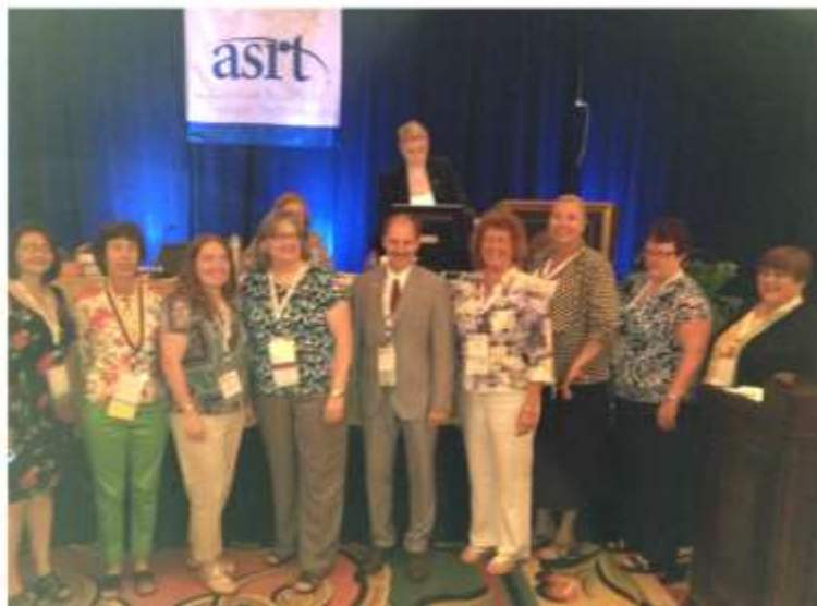
HOD Delegates representing New England